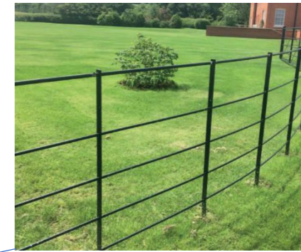
Metal estate fence to enclose play area with gate. Chosen to fit with a semi-rural feel and in keeping with the fence around the Glastonbury Thorn