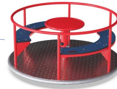
Physical: Social-emotional: cooperation