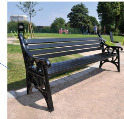
Cast metal ends to reinforce traditional feel and longevity